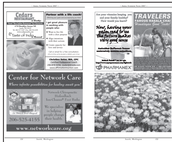
B & W 1/2 and 1/4 page