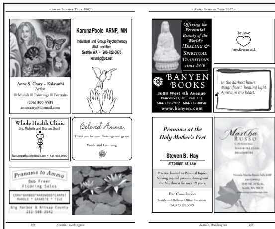
B & W 1/4 and 1/8 page