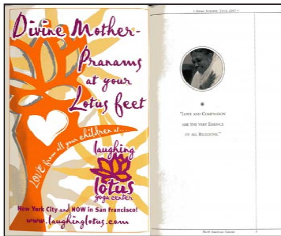
Color Full page